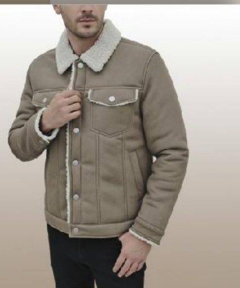
PU BONDED SHERPA JACKET