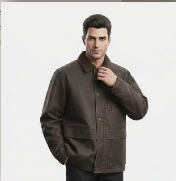
CANVAS COATING JACKET